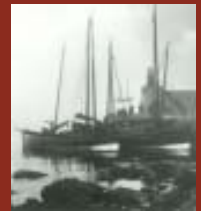
Main picture: View from Craigneen 1. The "wall" or well 2. The Shore 3. Ebb Tide