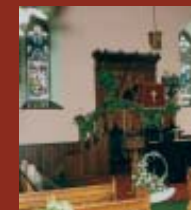
Main picture: United Presbyterian Church, Seafield Street, Banff