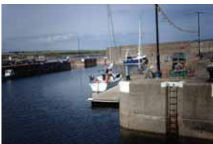
Whitehills Marina - outer basin.