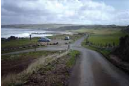
Red Well Carpark.