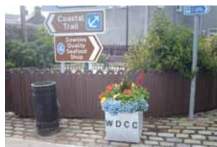
Planter at the Bullring.