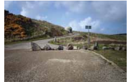
Red Well Carpark.

As with the lights at Blackpots, this suggestion has been raised at previous consultations.