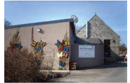
Boyndie Visitor Centre.