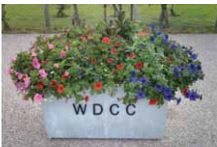
Village in bloom.