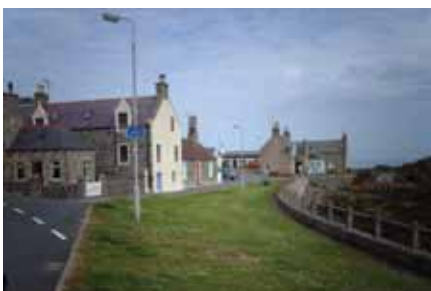
West of village.