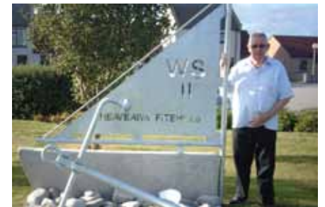
Whitehills entrance display.

The community would like to see more affordable housing being provided in the settlement. [P&ES, H&SW, PI]