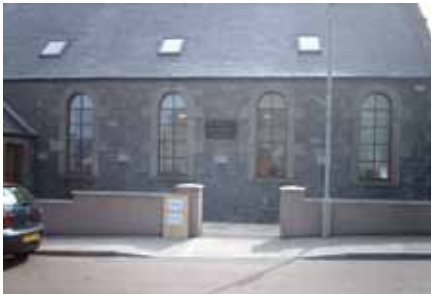
St Brandon Centre.

The latest version of the Area Plan lists one action specifically for Whitehills regarding the footpath from Boyne Quarry to Whitehills and includes a number of general intentions which might affect the village.